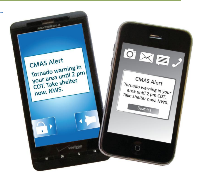
Actual message appearance will vary.